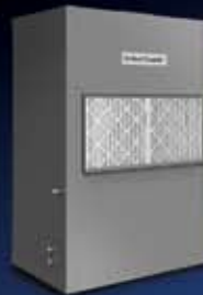
100% Outside Air (Indoor)