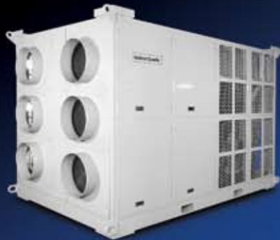
Portable Air Conditioning (Horizontal & Vertical)