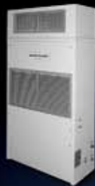
Water-Cooled Small Footprint