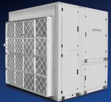
Variable Air Volume