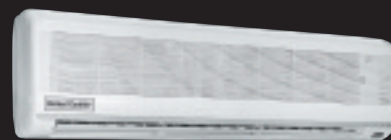
MiniWall Wall Mount Fan Coil Unit 1-3 Tons