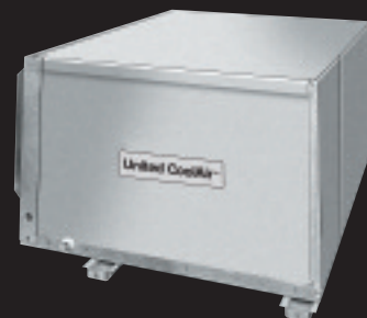
Indoor Condensing Units* Air-Cooled or Water-Cooled 1-9 Tons